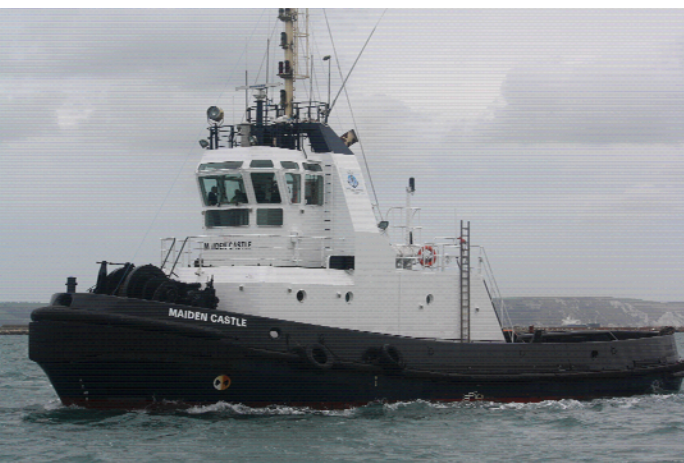
The 'Maiden Castle'

November 9 th 2009 marked the next step in the continued development of Portland Port with the official naming ceremony for their new tug "Maiden Castle". At one stroke the new arrival more than doubles the towage capabilities of the Harbour, having a greater towing capacity than the Harbour's three existing tugs combined.