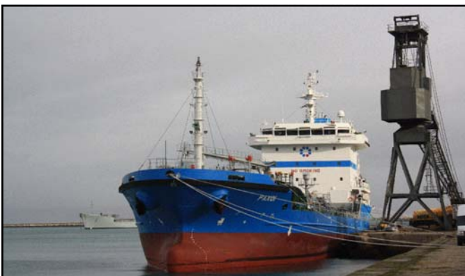
New Barge ‘Paxoi’

Bunkering in Portland is conducted by modern double-hull supplying vessels, 24 hours a day, 7 days per week. The local service centre ‘Portland Bunkers International Ltd’ provides technical and logistics support to operators.