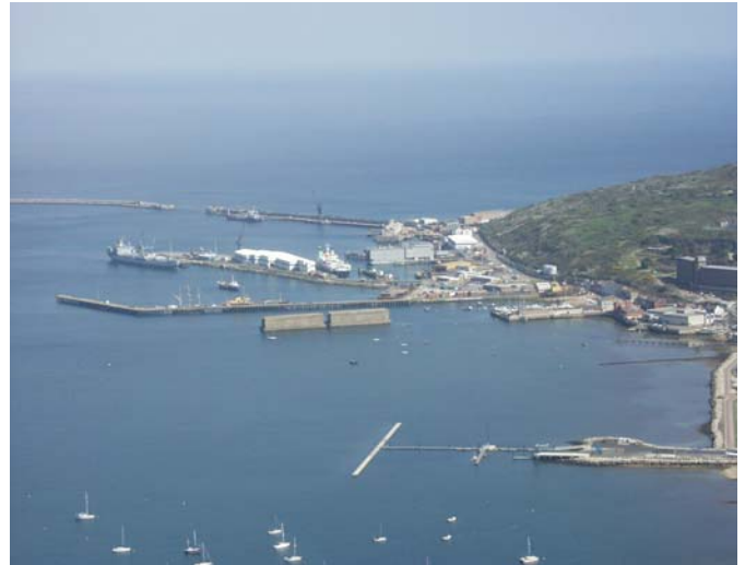
Portland Port a perfect location for renewable energy projects

waters it is well able to accommodate the large ships needed to import the raw materials required. It then makes the ideal site for the assembly of the wind turbines and subsequent operational support of West Isle of Wight. To this end discussions have already begun with the developer and it is hoped that agreement can be reached for this exciting project.