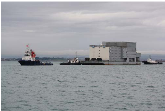
Jascon 27 departing Portland for West Africa

The 3,000 mile voyage is set to take 21 days, pending no delays en route!