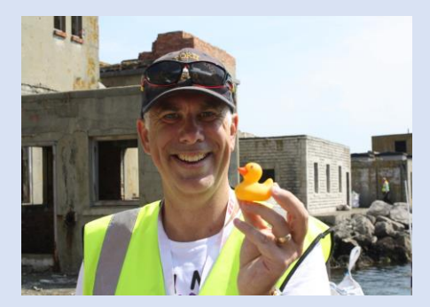
Checking out the wildlife, they get everywhere!!